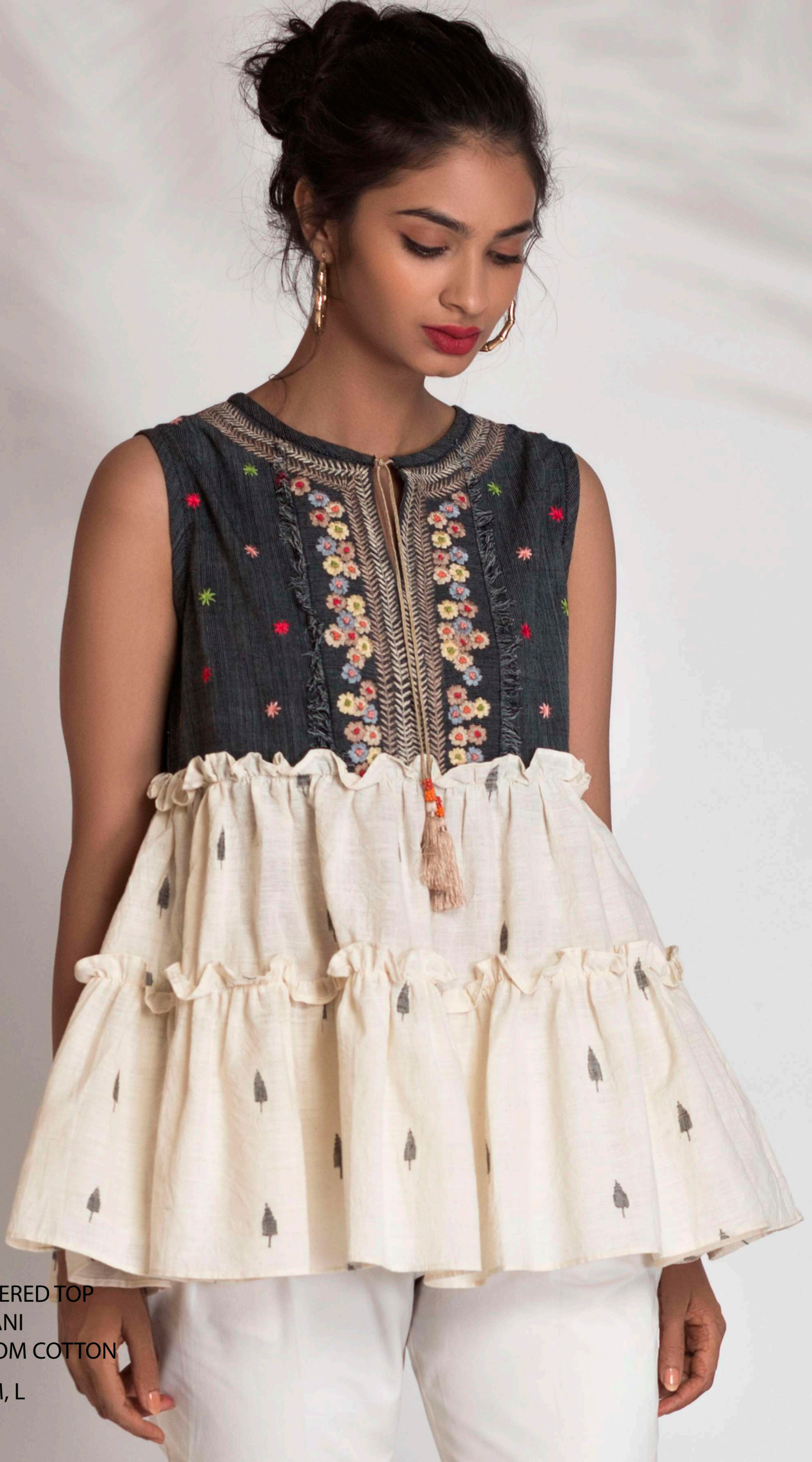
VIVI - BK EMBROIDERED TOP IN JAMDANI HANDLOOM COTTON SIZE - S, M, L