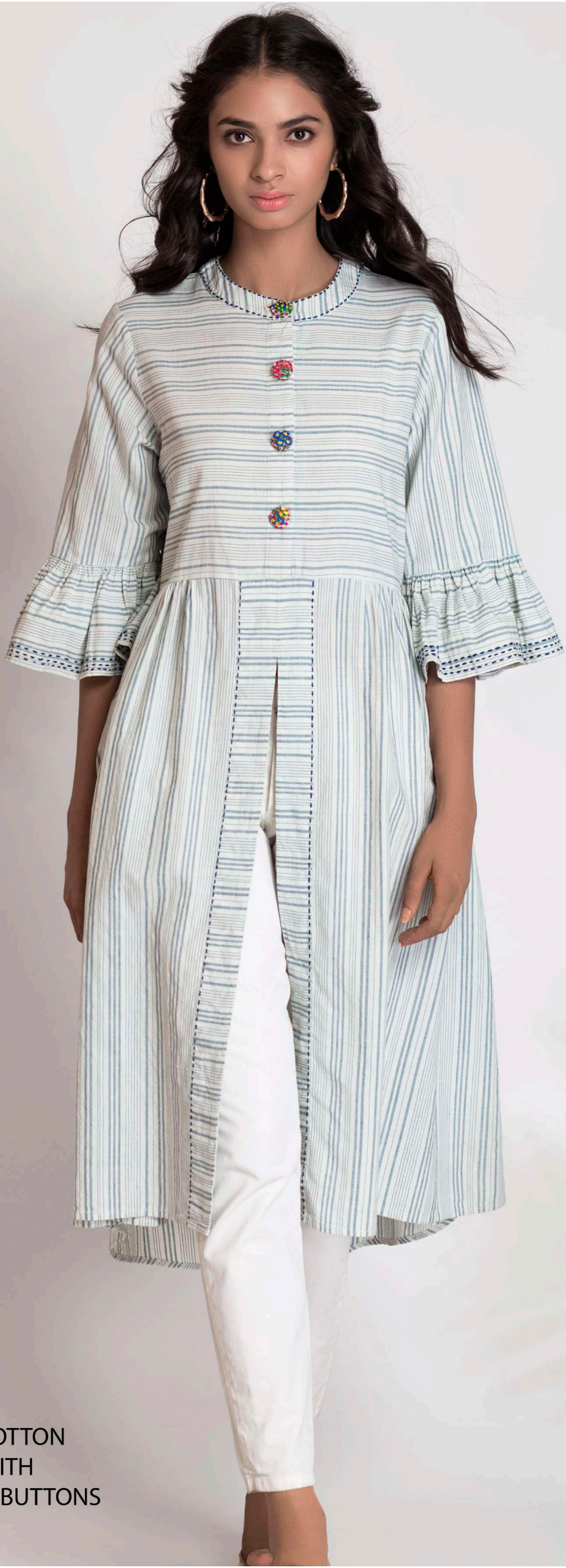
TALITA - CT HANDLOOM COTTON SHIRT DRESS WITH EMBROIDERED BUTTONS SIZE - S, M, L