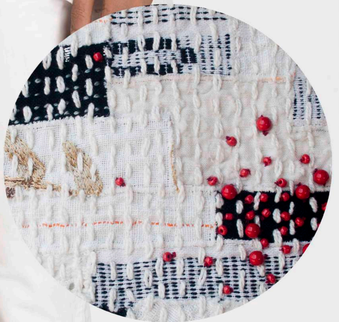
BORO BLOUSE WITH PATCHWORK EMBROIDERY SIZE - S/M, M/L