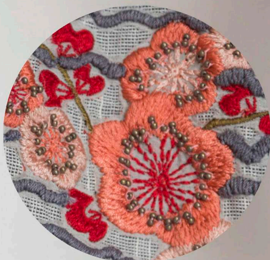
LUNA IKKAT BARDOT DRESS WITH EMBROIDERY SIZE - S/M, M/L