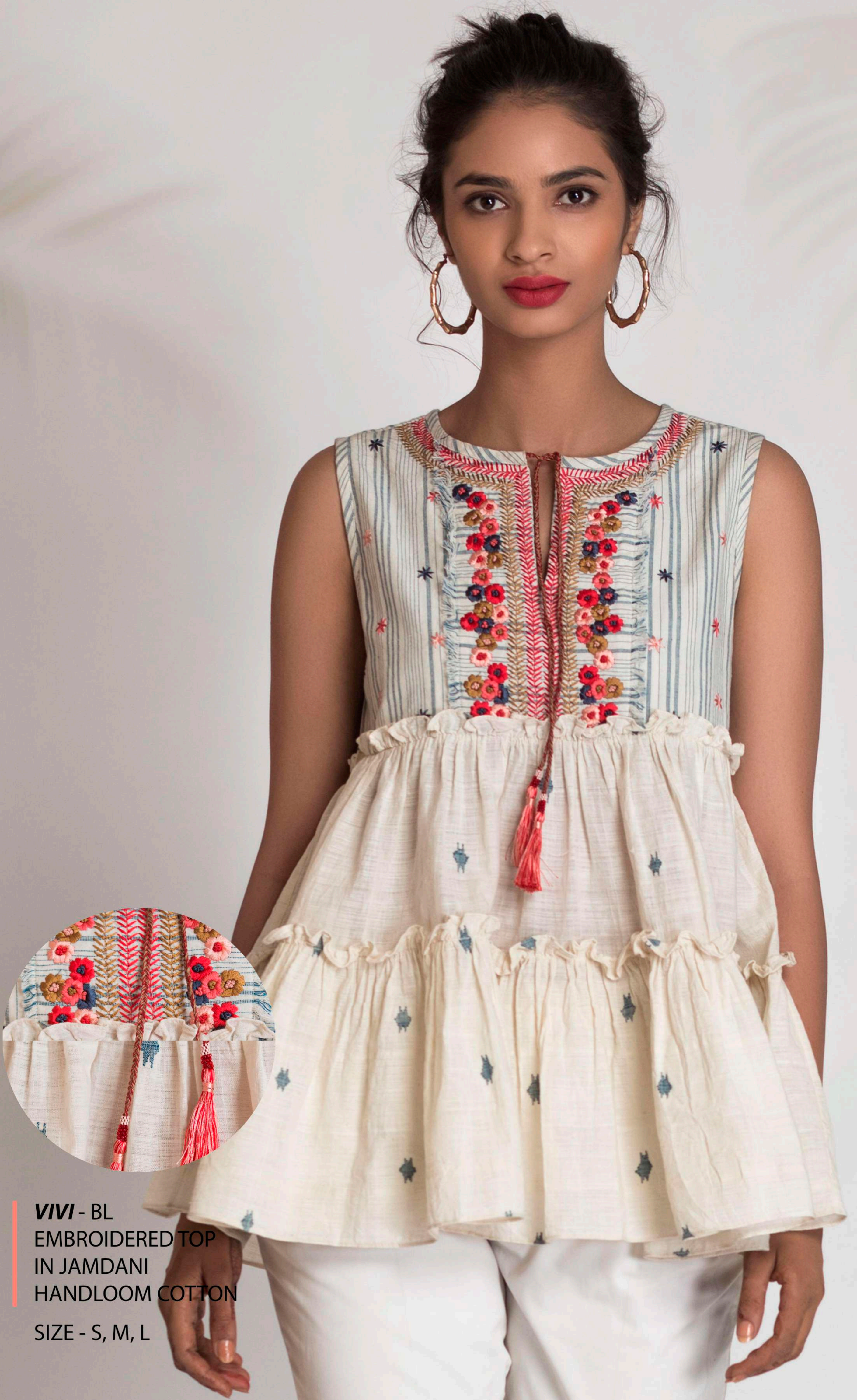
VIVI - BL EMBROIDERED TOP IN JAMDANI HANDLOOM COTTON SIZE - S, M, L