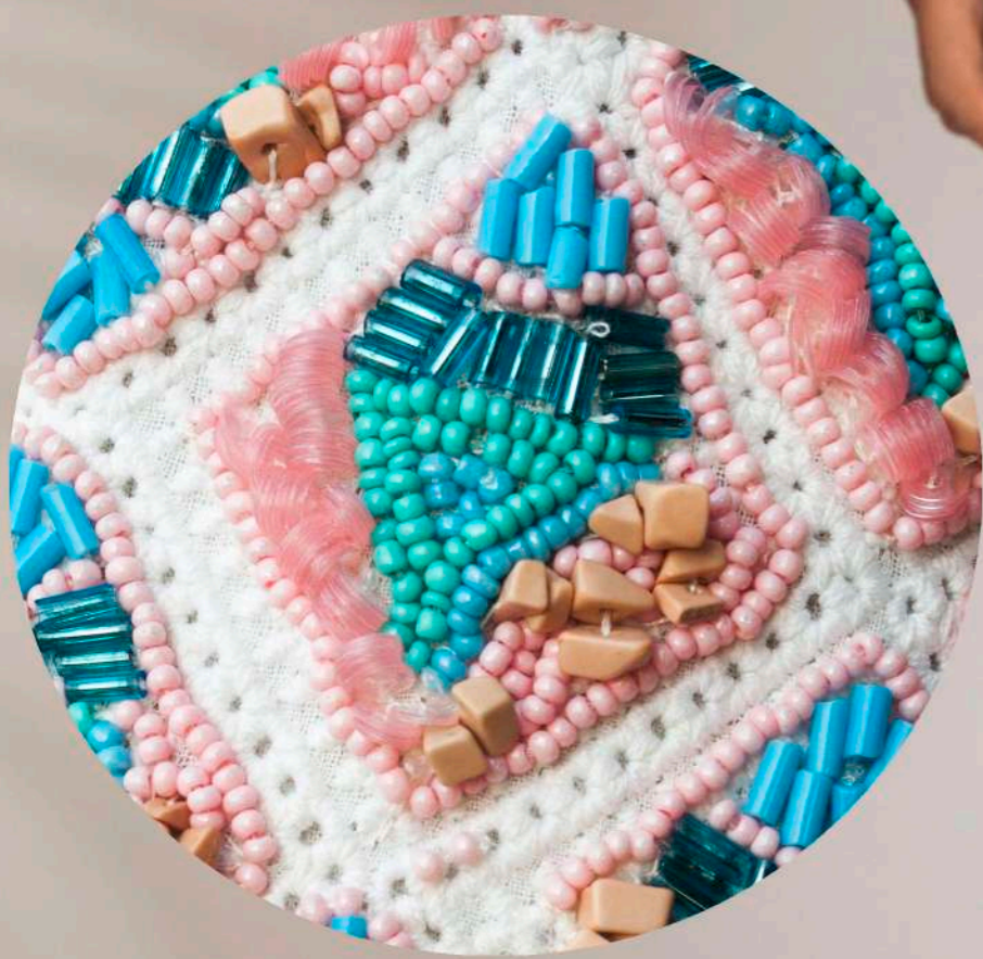
HOLY BEADED CAMISOLE IN CRINKLED COTTON SIZE - S, M