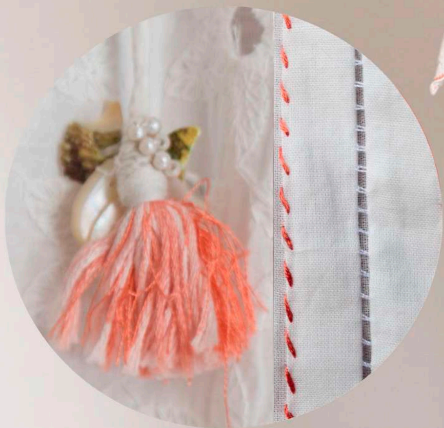
SOLEIL BRODERIE (SCHIFFLY) DRESS IN COTTON SIZE - S, M, L