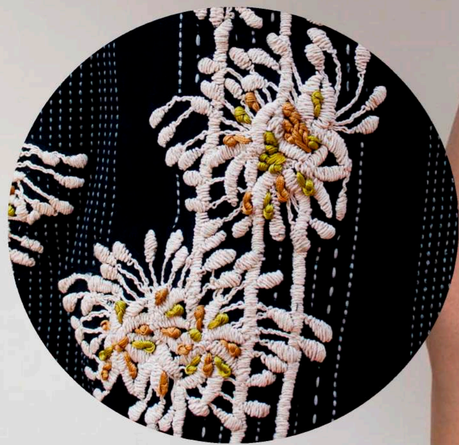
EVIE EMBROIDERED TEMPLE BORDER HANDLOOM COTTON TUNIC SIZE - S, M