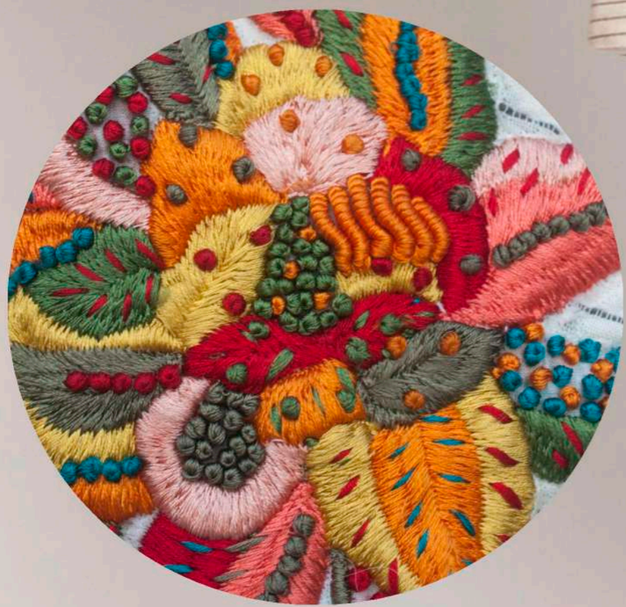
SAVA HANDLOOM COTTON TUNIC WITH 3D EMBROIDERY SIZE - S/M, M/L