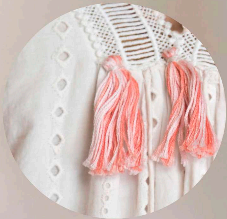
ARIO BRODERIE (SCHIFFLY) TUNIC IN COTTON WITH LACES SIZE - S, M, L