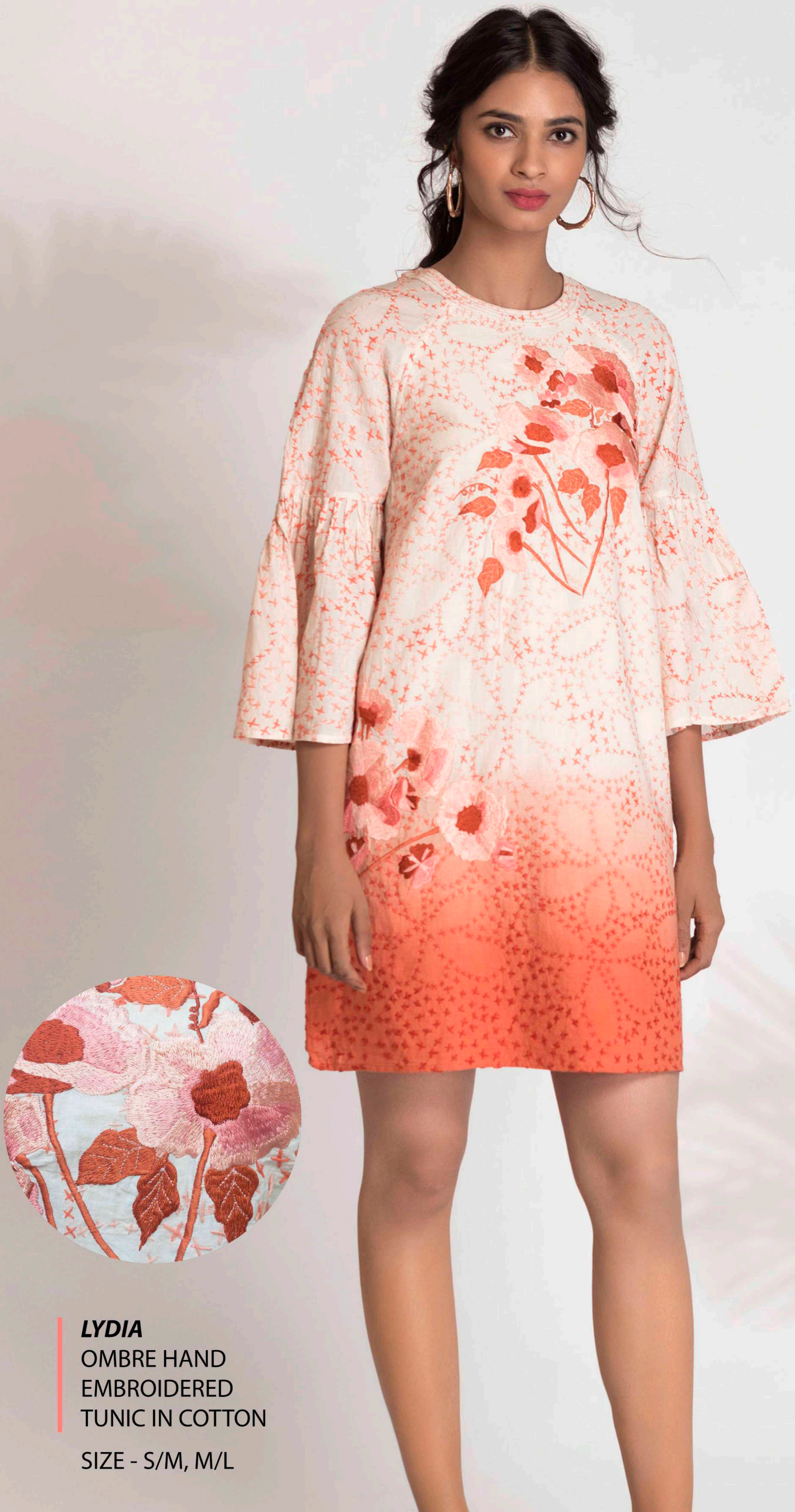
LYDIA OMBRE HAND EMBROIDERED TUNIC IN COTTON SIZE - S/M, M/L