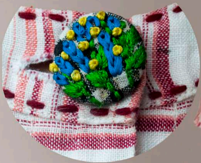
TALITA - CL LINEN SHIRT DRESS WITH EMBROIDERED BUTTONS SIZE - S, M, L