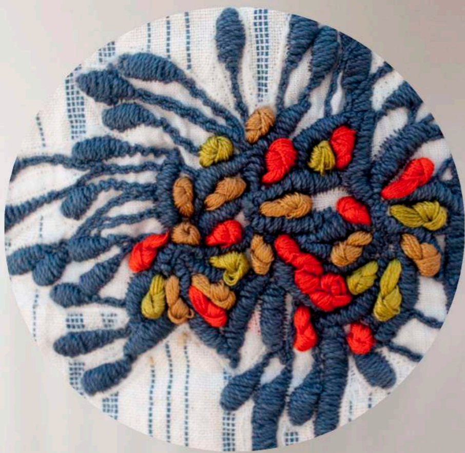
DAKOTA-BL HANDLOOM COTTON EMBROIDERED DRESS SIZE - S, M, L