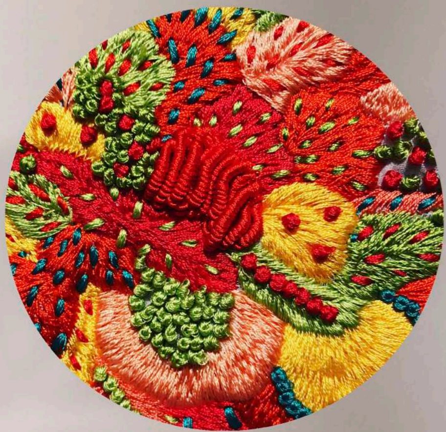
SAVA HANDLOOM COTTON TUNIC WITH 3D EMBROIDERY SIZE - S/M, M/L